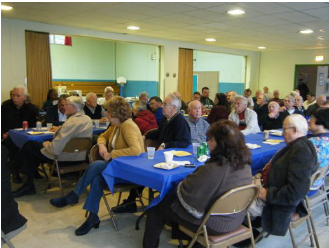
A large turnout for the Recognition meeting